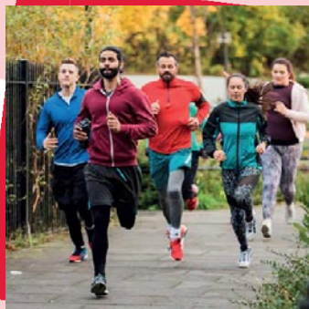
Leadership in Running Fitness